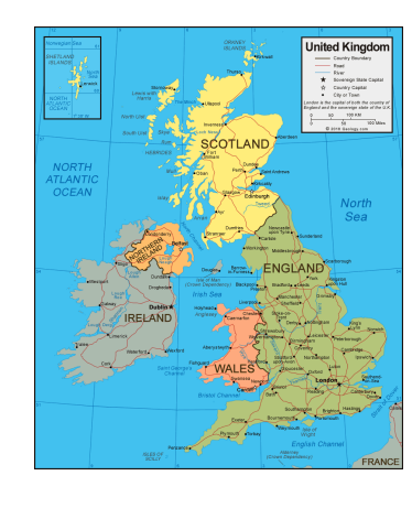
The United Kingdom