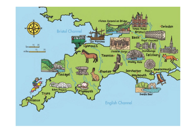
The South West